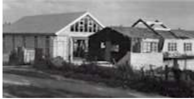
Building over the Wooden shed in the late 60's with our brick building MKI!

Our first building was built in the late 1920's and was a wooden shed on signal road.